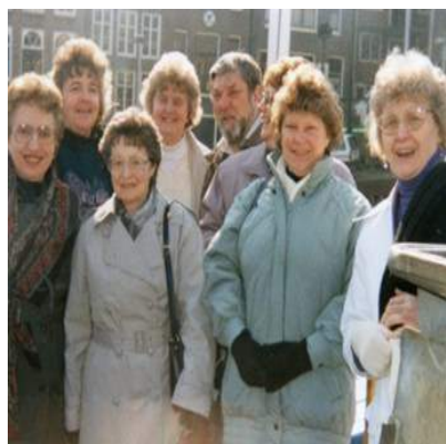
We are off to Amsterdam