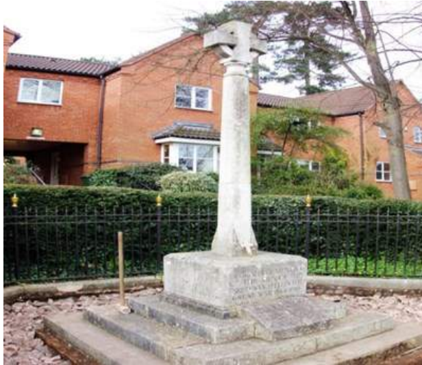
Figure 1 Restoration in progress