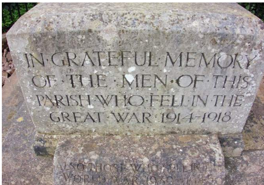
Figure 2 Aligned surface of the base of memorial