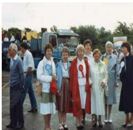
Judging Studley Carnival Floats