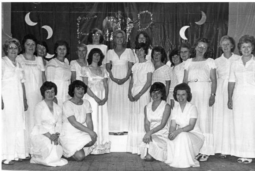
Women's Club Gala Evening Choral- 1977