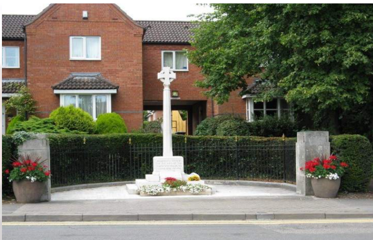
Restored War Memorial.