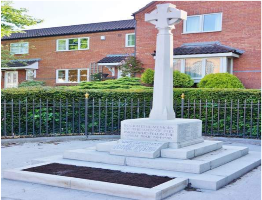
Figure 4 Newly restored War Memorial