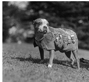
Sergeant Stubby (1917 – 4 th April 1926)