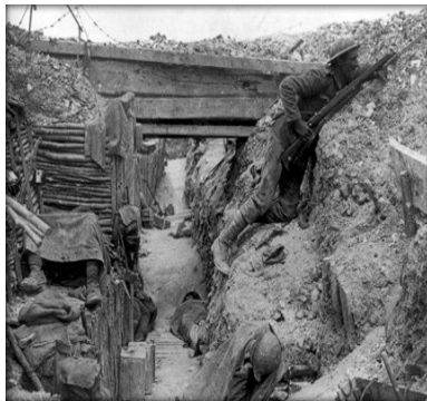
Soldiers fighting in trenches