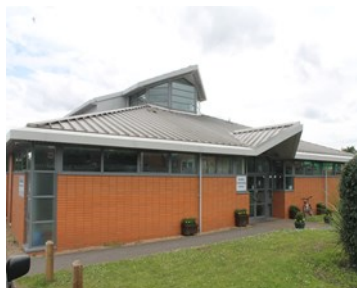
Studley Village Hall

Residents are not to leave any items at other times as this is fly tipping and liable for prosecution. Use green bin for your garden waste. Suspected commercial waste will not be accepted